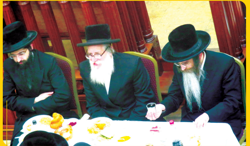
At the yahrtzeit seudah marking the yahrtzeit of Harav Yehoshua (Shaya'le) of Belz, zy"á , at the Belz Shul on 45th Street.