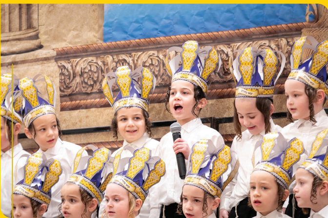
First-graders receiving their first Chumash at the Satmar Cheder in Boro Park.